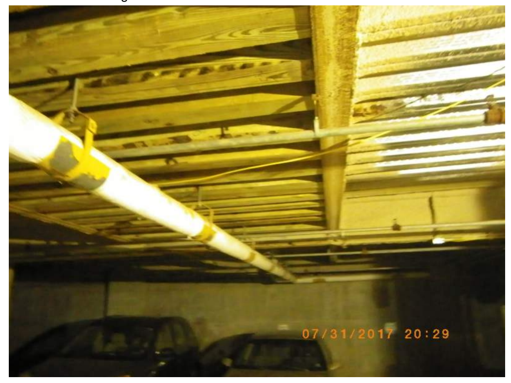
Figure 4. Supplemental shoring / work area support.