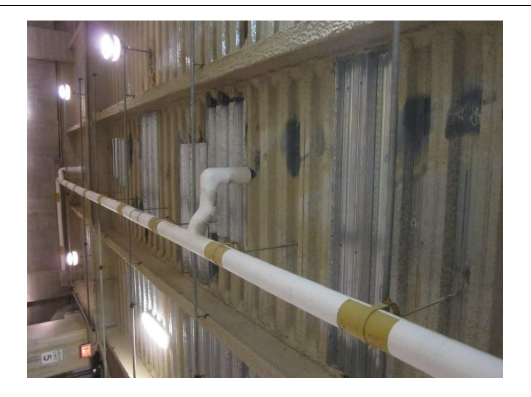
Figure 1. Supplemental decking added to supplement metal deck that corroded through.