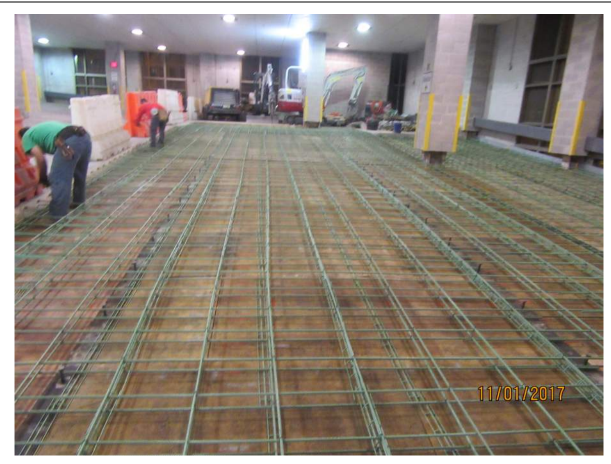
Figure 8. Deck reinforcement in place prior to concrete placement.