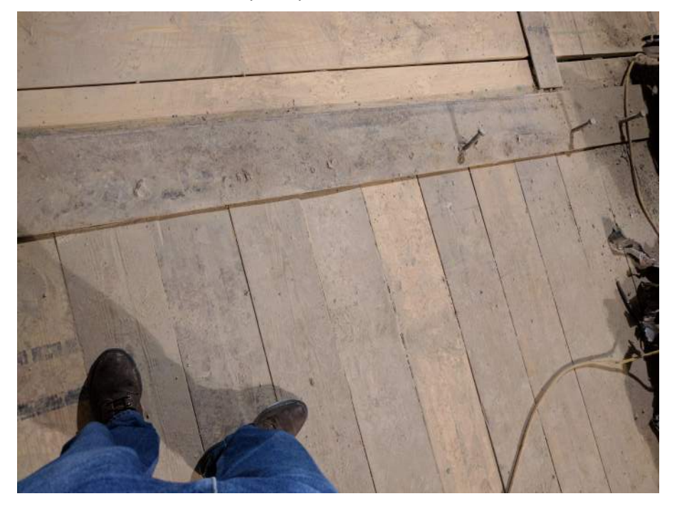
Figure 6. Formwork in progress (note missing shear studs).