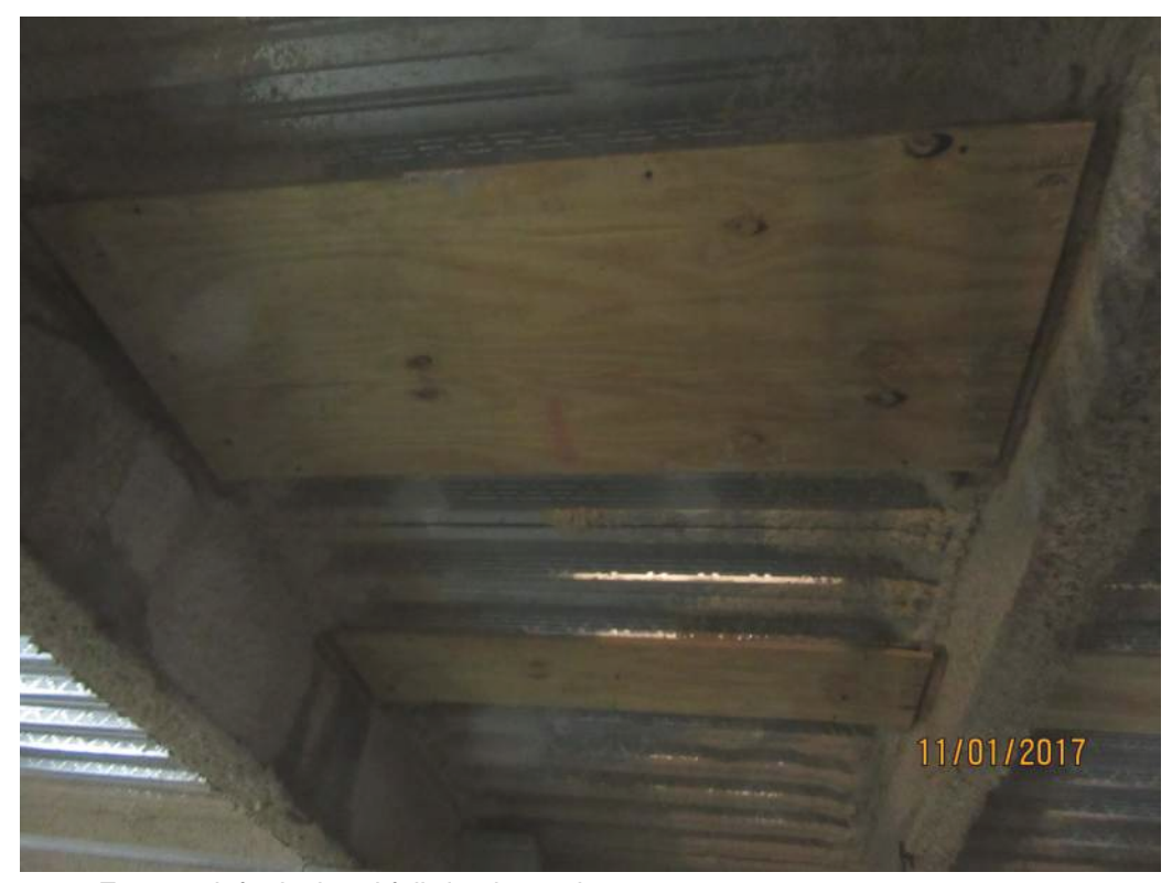
Figure 5. Formwork for isolated full-depth repairs.