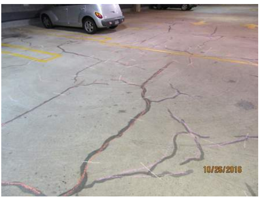
Figure 2. Extensive cracking on parking deck surface.