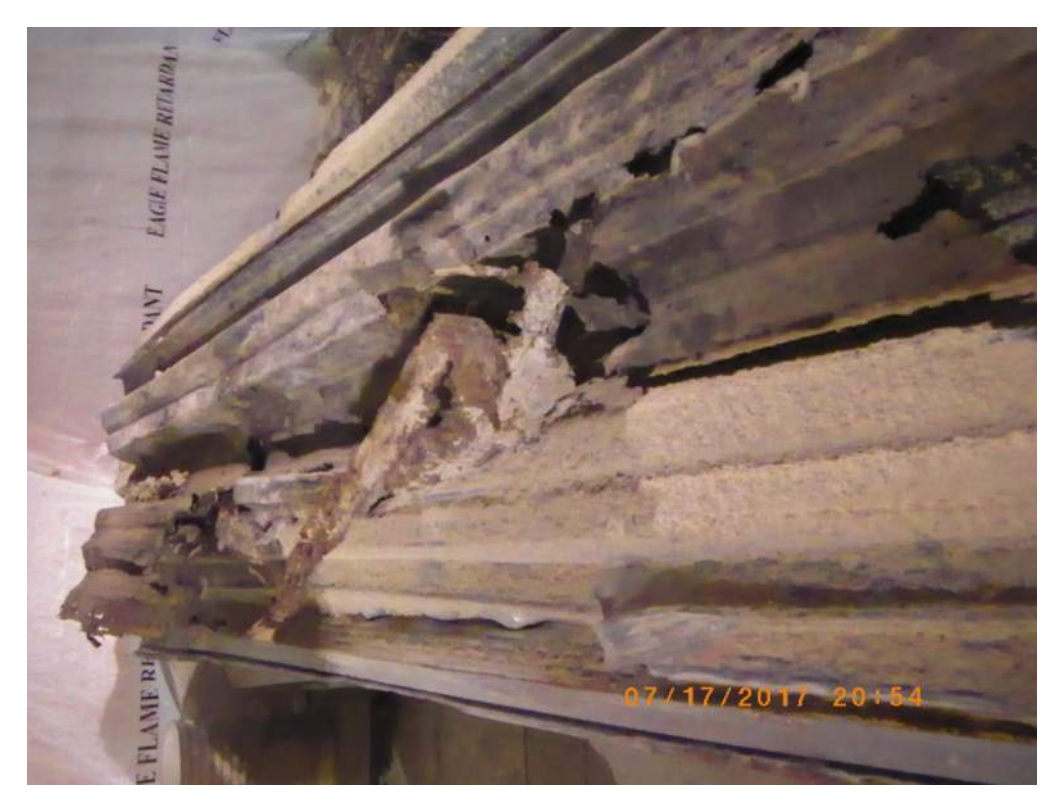
Figure 3. Corrosion damaged metal deck after removal of concrete.